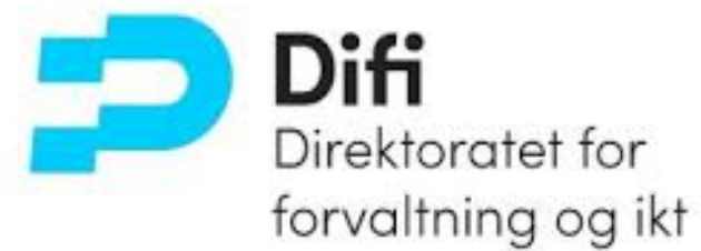
Agency for Public Management and eGovernance (National public procurement agency – procurement guidance)