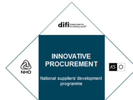
National programme for Supplier development (Co-ordinating role – Assistance market dialogue)